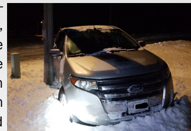
Bigelow & Mineral Springs Rd. Crash

With last Friday's snow event, Owatonna area drivers faced some difficult driving conditions on our roadways. Winter driving is tough enough, but when you mix in alcohol, it can be even more difficult as a couple drivers experienced. On Friday night, patrol officers were called to the W. Frontage Rd for a motorist assist. There, they discovered a vehicle in a snowbank being hooked up to a tow truck. The driver was found still in the driver's seat and showing signs of intoxication. He was arrested and provided a breath sample of .08. On Saturday evening, patrol officers were called to Bigelow Ave. and Mineral Springs Rd. for a crash. There they found an unoccupied vehicle up in a snowbank—a deputy found the driver walking a short distance away. This driver was also showing signs of intoxication, arrested and provided a breath sample of .15, or almost twice the legal